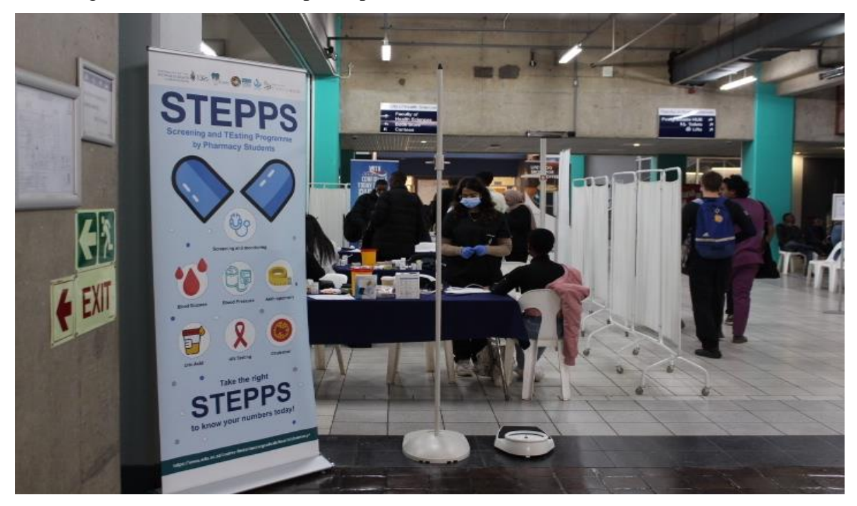
They contributed to the Screening and Testing Programme by Pharmacy Students (STEPPS) project, organizing screening events for HIV and cardiovascular risk factors across various

Second and third-year Bachelor of Oral Health Sciences (BOHSc) students engaged in Inter-Professional Education by collaborating with Pharmacy students to conduct oral hygiene screening and education for 967 participants.