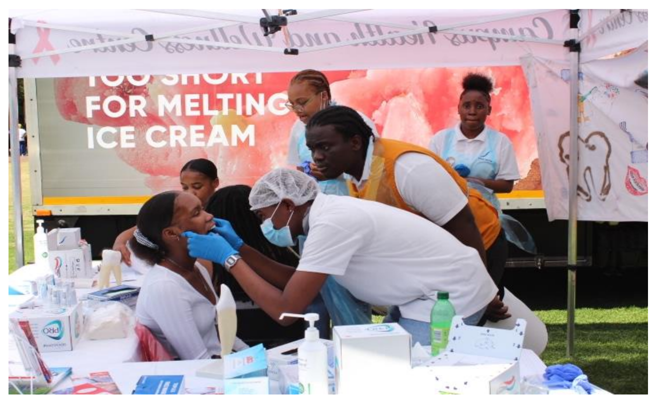
Figure 3 BOHSc III students screening in West Campus

The event took place at Wits East Campus and Wits Medical School, where 1407 students and staff were screened by SOHS students under the supervision of Oral Hygienists, Dental Therapists, and Dentists from the Community Dentistry Department.