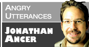
ANGRY UTTERANCES JONATHAN ANCER

I crack them but the next clue proves unsolvable: My mud turns into Kevin Pieterse (5) . My mud? KP? It's been such an emotional night I can't think straight. She wakes up again at 1am.