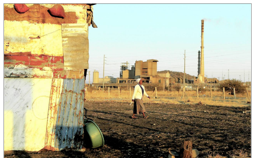
APPALLING CONDITIONS: A woman walks in front of her shack with the Lonmin mine in the background.