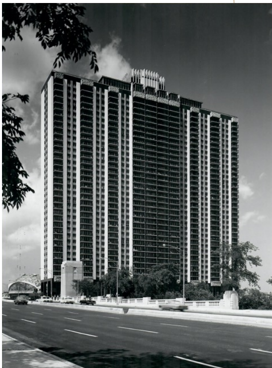
Fig. 6. Outer Drive East, Chicago, the Gold Coast area off Lake Michigan

The buildings Martin designed and saw to completion include homes, factories, high-rise condominiums and apartment buildings, and office buildings. Reinheimer's buildings include the 27-story Carriage House at 215 E. Chicago, 40-story, 940-apartment complex at Outer Drive East, which overlooks Lake Michigan at 400 E. Randolph, and the Carlyle on Michigan Avenue, Chicago's Magnificent Mile.