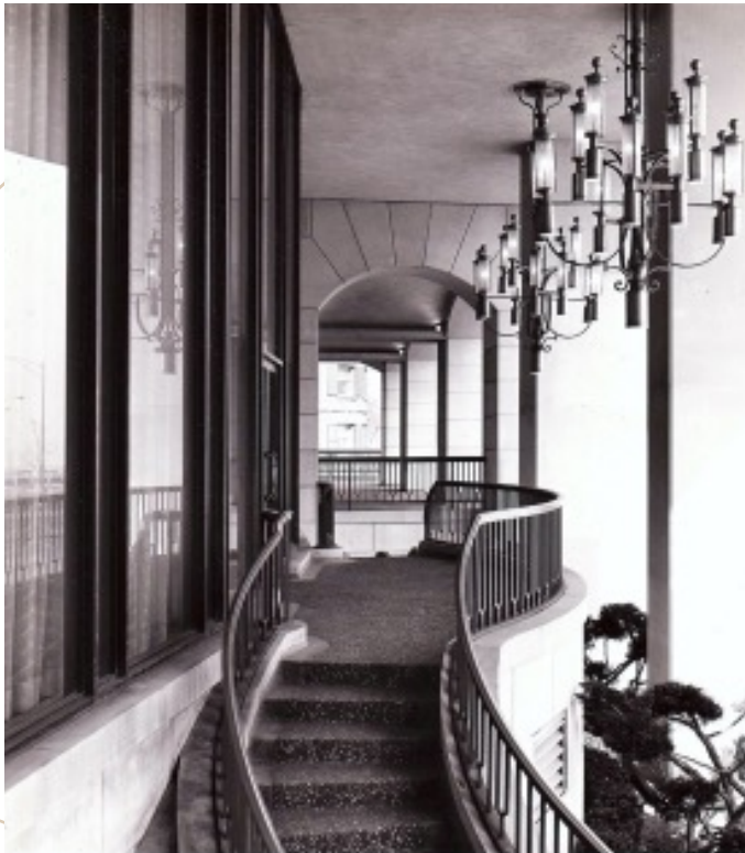
Fig. 8. A view of the mezzanine of the Carlyle Condominium, 1040 Lake Shore Drive, off Michigan Avenue, Chicago, Illinois