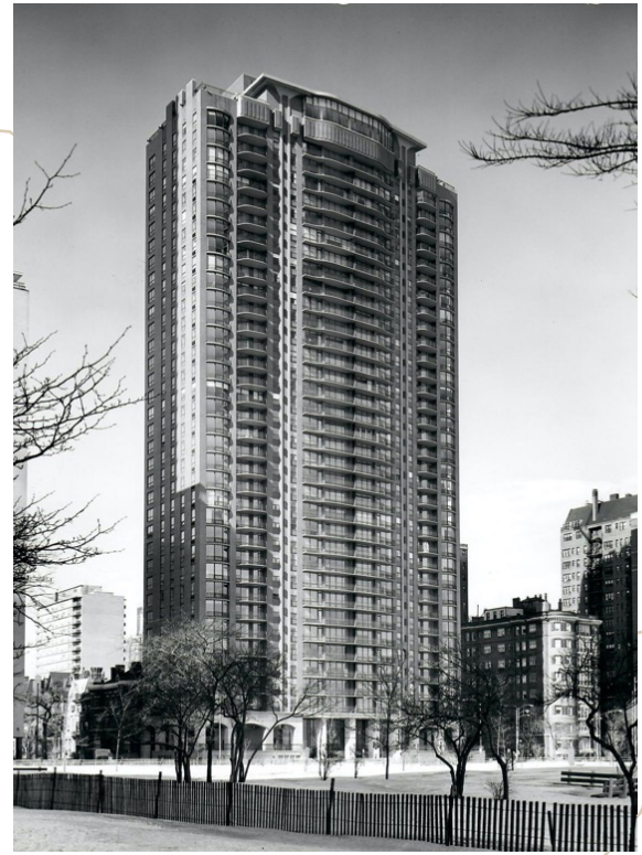
Fig. 9. The Carlyle Condominium, 1040 Lake Shore Drive, off Michigan Avenue (Chicago's Magnificent Mile), Chicago, Illinois