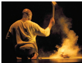
Gula Matari