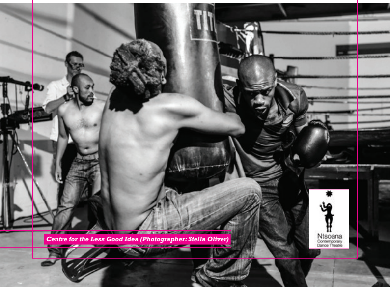
Centre for the Less Good Idea

This work originally premièred at the Centre for the Less Good Idea, Season 1.