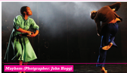
Mayhem