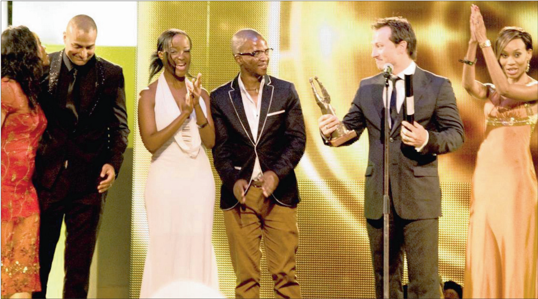
SHINING STARS: The sixth annual SA Film and Television Awards ceremony was held at the Gallagher Convention Centre in Midrand at the weekend. Some of the cast of Isidingo won the public vote for best TV soap and best ensemble in a TV soap.