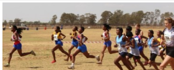
Striding out in the women's 4km event in last September's USSA cross country championships at CUT, Welkom

*The USSA track & field will be held @ TUT Pta on Fri 25 & Sat 26 April