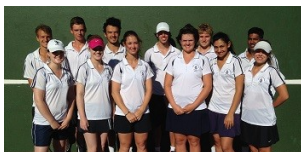
TENNIS, ANYONE? Wits' 2013 USSA tennis squad finished 5 th after a nail-biting match against rivals UCT.

The club has enticed new players to its ranks and has launched a Learn to Play programme for beginners, taught by qualified coaches.