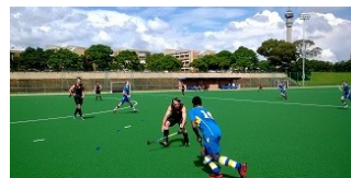
BLUE SKIES, GREE TURF: Saturday's annual Derby Day series against UJ was another opportunity for Wits to polish their act in preparation for Varsity Hockey in May