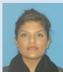
Jade Aspeling Development