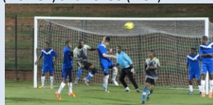
AIRBORNE: Goal-mouth action from last year's fixture against NWU-Mafikeng

Wits' women's and men's student football teams kick off their 2014 USSA Gauteng Football League (UGFL) season against Vaal Univ. of Technology (VUT) tomorrow night at the Bidvest Stadium @ 18h30 (women) and 20h30 (men).